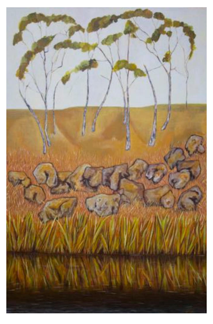
STRGC-9, Acquired by Brimbank Council 2018 Oil on Canvas 60 x 90 cm