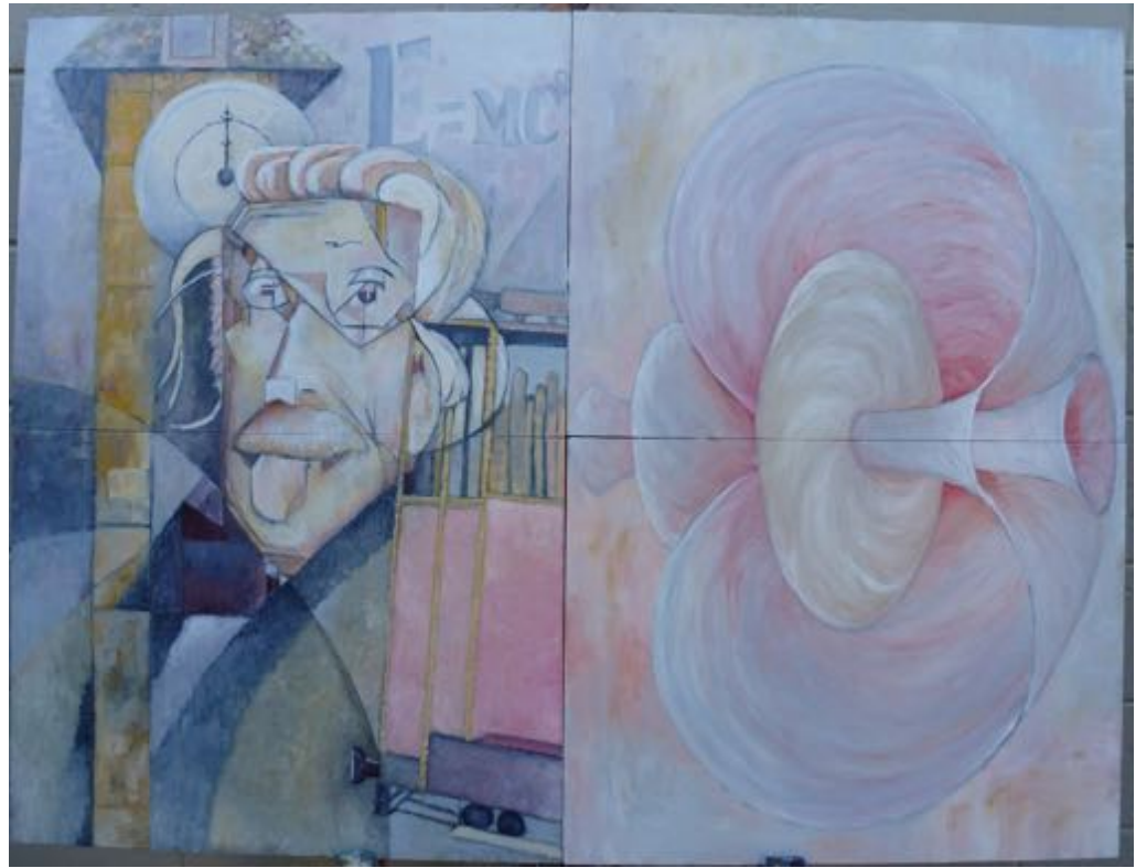
St Albans SC Science Mural