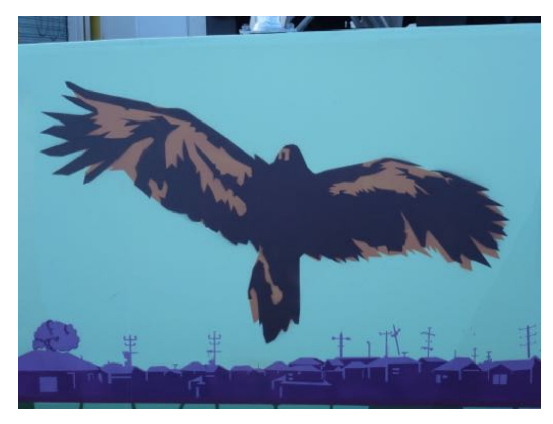
Regional Rail Link Mural Anderson Rd