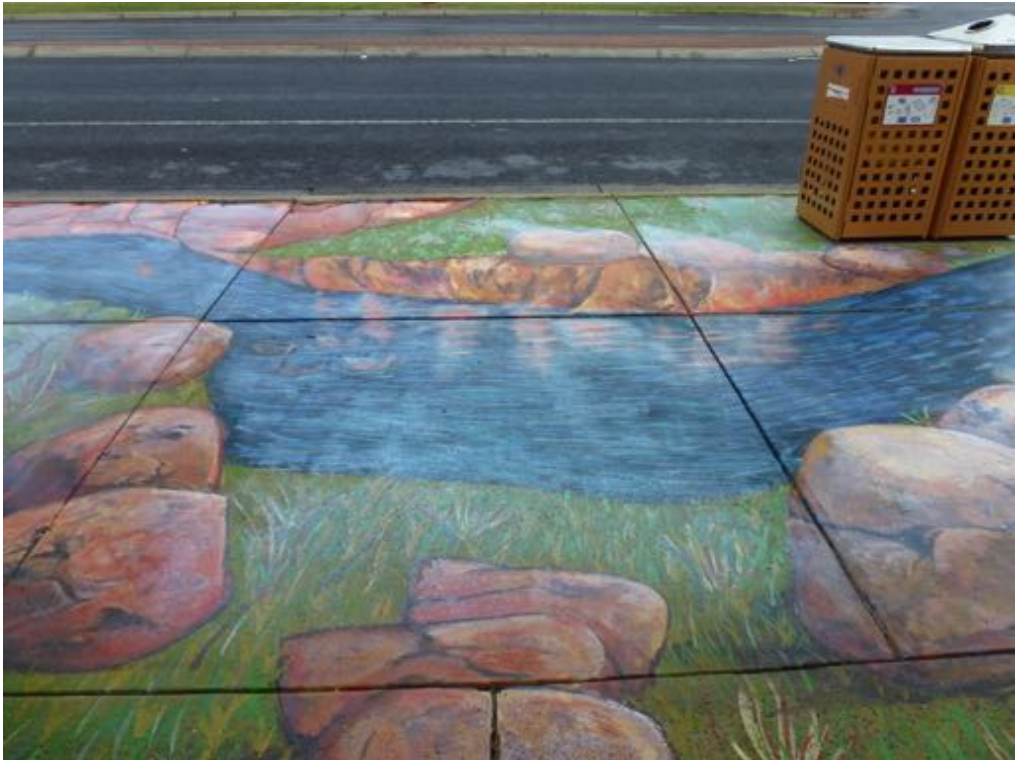
Linking Melton South Pavement Community Art Project