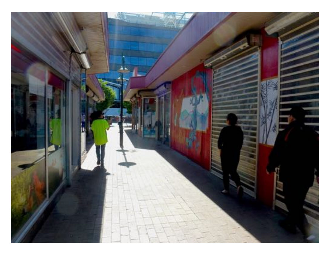
Good Luck Alley – Sunshine CBD – "Highly Commended" Main St Australia Award 2016