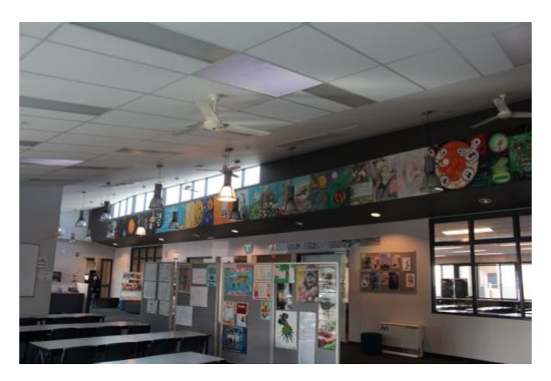
St Albans SC Science Mural