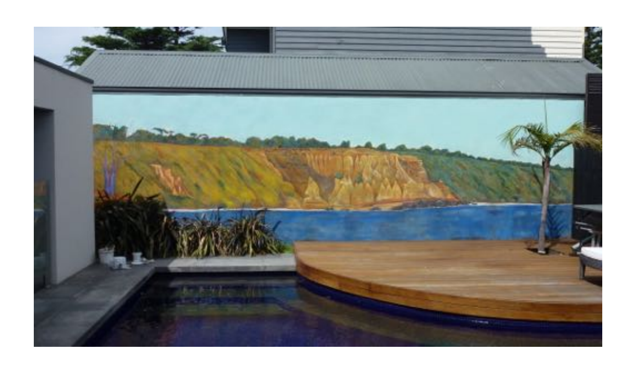
Red Bluff Mural – Private residence Sandringham 2018