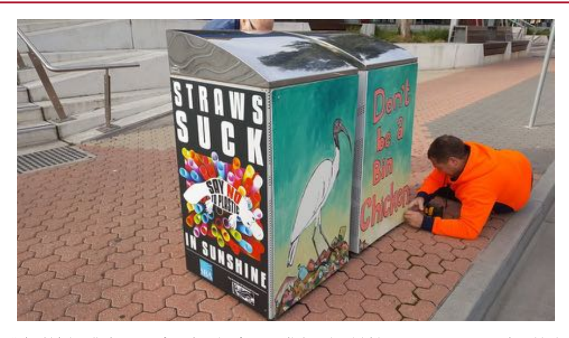
"Bin Chicken" Bin Wrap for Friends of Kororoit Creek rubbish awareness campaign 2018